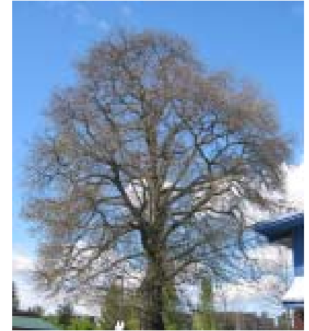
A Spanish Chestnut Tree ( Castanea sativa ) located on NE 175th Street is one of two City Heritage Trees.

A city-approved recognition plaque will be placed at any officially designated heritage tree(s). The tree(s), nominee and property owner will receive special recognition from the City Council.